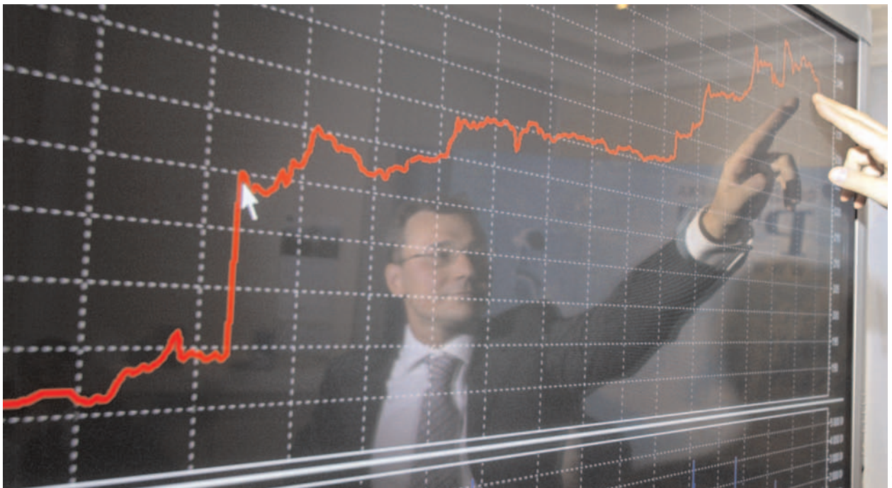
MOSCOW/Jan. 2006 | Russia's main stock exchange reported heavy trading of shares of Gazprom, the largest gas producer in the world, on the first day that the state company was directly listed.

With a unique combination of quick filing and comprehensive reporting, AP Financial News equips your audience with the background and information they need on companies, the broader markets and economic and financial policy decisions. Targeted for the individual investor, no other news service provides a more complete view of events to help individuals execute long-term personal investment strategies.